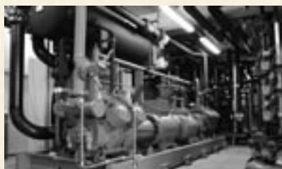
High efficiency heat pump system for a greenhouse for orchids