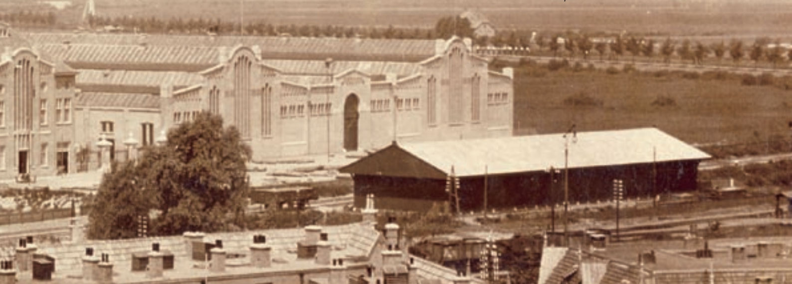
The old plant in 1913